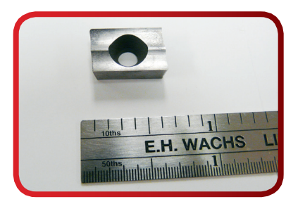
Less than 1" (25.4mm) long, insert bits are easily changed and fit all DuoEdge holders