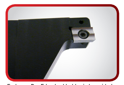
End prep DuoEdge tool holder is two sided for high & low range single point machining