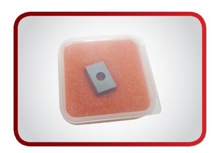
Inserts are small enough to carry in your pocket. Inserts come in Single Pack (shown) or 10 Packs