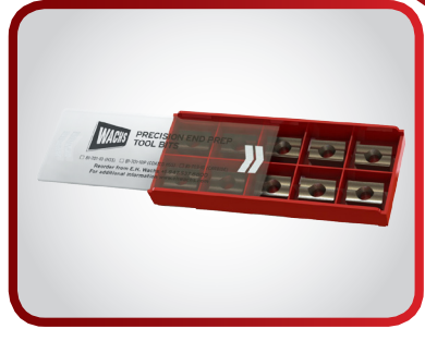
For additional cost savings many DuoEdge inserts are available in 10 Packs, offering 20 cutting edges per package