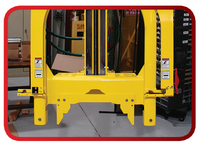
Guillotine saw shown with custom saddle for cutting steel I-beams, others available