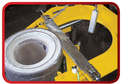
Wachs Goliath® saw shown horizontally severing multistrand conductor

Installation Method: Standard cast iron V saddle and mounting chain, optional autoclamping on select models, custom mounting saddles for non circular shapes such as squares and I-beams