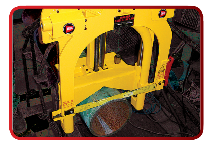
Quickly cuts through pipe with an orbital cutting motion that extends blade life