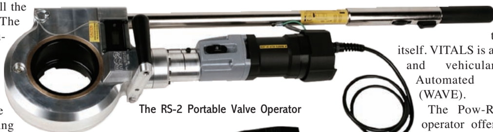
The RS-2 Portable Valve Operator

The Heavy Duty Split Frame (HDSF) line is the most robust in the E H Wachs stable, built