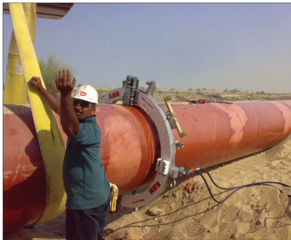
Heavy Duty Split Frame (HDSF) line is the most robust in the E H Wachs' stable

This line of machines will fit pipe from 600 mm (24") and up. While some procedures require optional accessory kits, there is no bet-