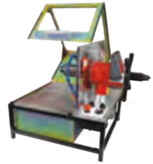
Weld Coupon Station