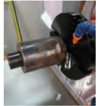
Weld Coupon loaded, ready for prep