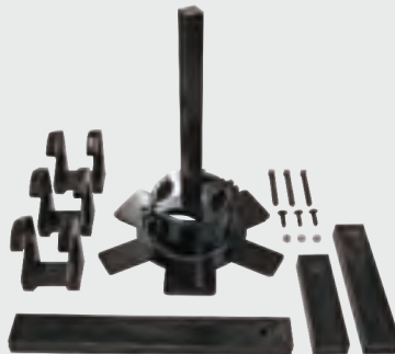
P-2 Handwheel Adapter