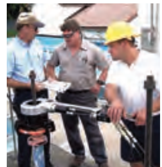
RS2 operating rising stem valve