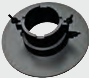
RS2 Dedicated Handwheel Adapter P13-017-4007-00