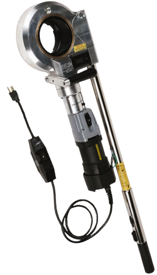
RS2 Rising Stem Valve Operator electric model shown