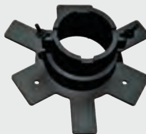
RS2 Universal Handwheel Adapter P13-017-4008-00