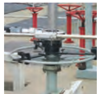
Allows for 2-person operation