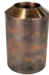
Coupon shown with weld-ready bevel