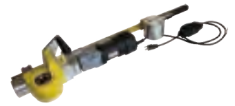
P-2 Electric 110V Model