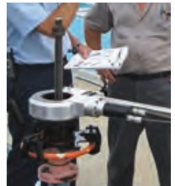
RS-2 Rising Stem Valve Exerciser