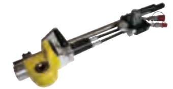
P-2 Hydraulic Model