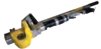
P-2 Pneumatic Model