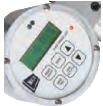
Vitals torque control available on select models.