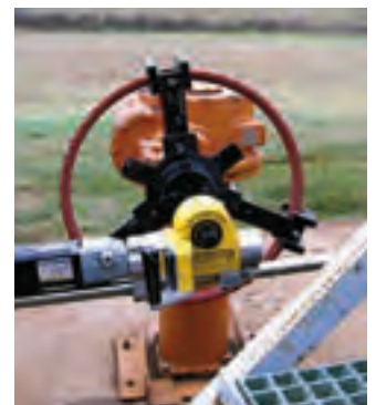
P-2 Electric shown with Handwheel Adapter