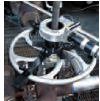
RS2 with Handwheel Adapter