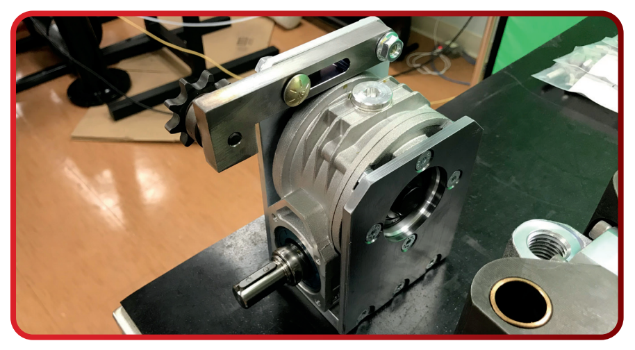
Feed Drive Assembly with Chain Tensioner