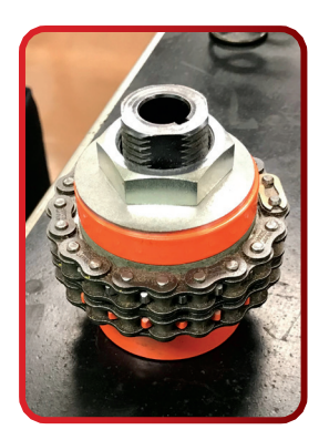
Heavy Duty Overload Coupling

TLC SD Model E Pneumatic Kit (shown) Part Number 02-5000-01 TLC SD Model HE Hydraulic Kit Part Number 02-5000-02