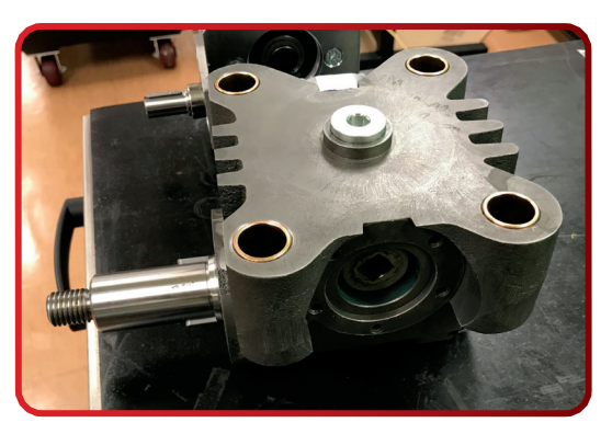
Redesigned Cutter Spindle Gearbox Assembly