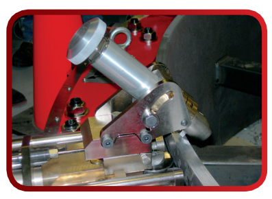
Optional counterbore and reverse beveling module bolts to tracking slides to deliver perfect preps