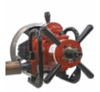
EP 424 Single Point Deluxe with form tooling rotating head