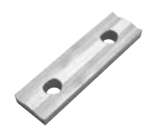
Premium grade HSS insert (2 sided)