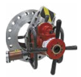
EP 424 Flange Facing with single point machine slide

Weight: Full modular construction with each module under 31.75kg (70lb), total weight with storage case 71.67kg (158lb)