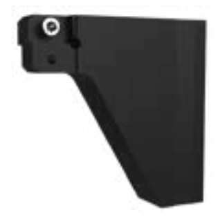
DuoEdge Single Point Holder