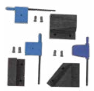
Insert holder kit for axial facing and beveling 37.5°