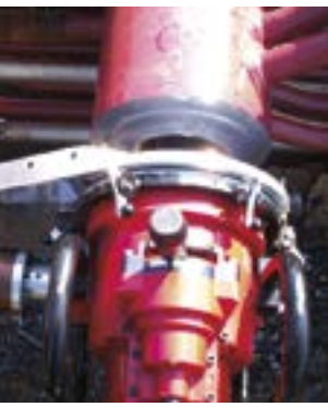
EP 424 SpeedPrep<sup>™</sup> deluxe prepping heavy wall pipe

EP 424 SpeedPrep™ deluxe beveling with form tool rotating head