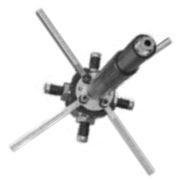
Self-centering standard mandrel