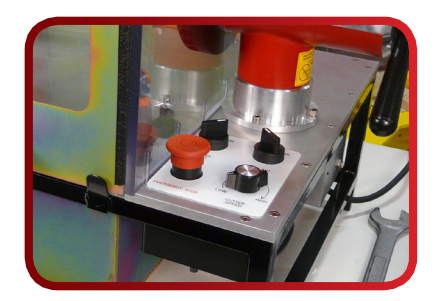
All controls are externally mounted and grouped together for convenience. Emergency stop button is a standard safety feature.