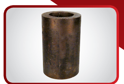
Use your saw to cut ordinary pipe sections into coupons. Control exactly the material, thickness and coupon length that works best for you