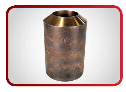
Coupon shown with weld-ready bevel. Recirculating coolant dramatically extends the life of the tooling – get up to hundreds of preps on a single tooling bit