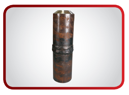
Welded coupon - to reuse simply cut out the old weld with your saw, re-prep with the Coupon Station and weld again