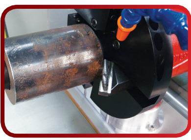
Wachs Coupon Station quickly puts the perfect weld bevel on your cut sections. Machining is visible through the enclosure

Weight: Without coolant 105 lbs (47.6Kg)