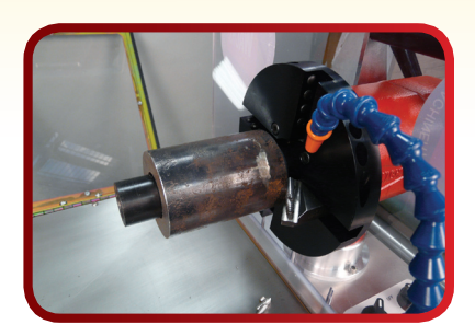
Solid build quality ensures a long service life. The heart of the Coupon Station is Wachs super rugged SDB 206/2 I.D. mount machine tool.